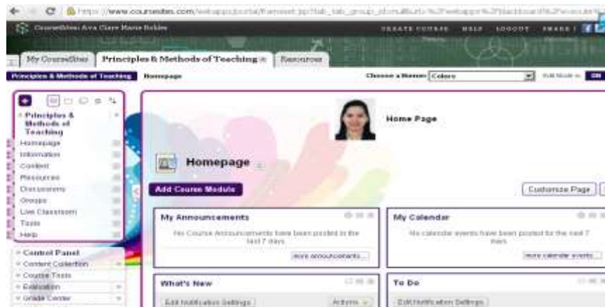
Fig .1 Sample of a Teacher's Course Site by Blackboard

In this study, course sites by Blackboard, which is a free learning management was utilized to engage students in online learning and share open education resources. Fig.1 is a sample of teacher's course site in Ed 103.